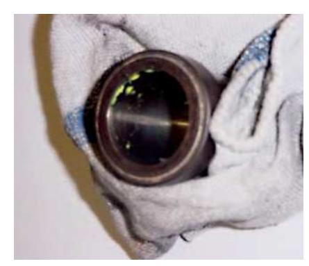
Fig. 3. Plate-out on the conical extruder sleeve when extruding with RadGlo EA10 (left) and RadGlo RPC10 (right)